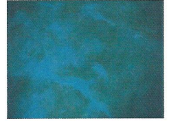
MIDNIGHT BLUE (black base)