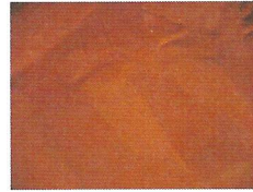
BURNT ORANGE (black base)