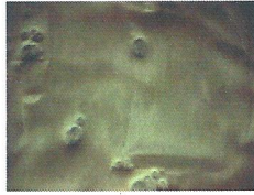
PEWTER (black base)