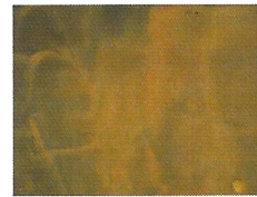
TOFFEE (black base)