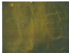
BRONZE (black base)