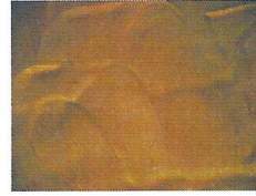
COPPER (black base)