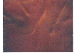
DARK CHERRY (black base)