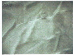
GUN METAL (black base)