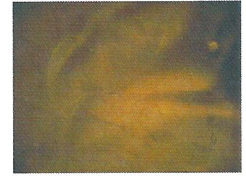
BARK BROWN (black base)

Note: Color samples on this chart represent the color of the metallic on top of a black pigmented epoxy. Suggested pigmented epoxy bases can be either Dura-Kote Pigmented Water Based Epoxy or Dura-Kote Pigmented Epoxy 100. Changing the base color can be done, when this is option chosen create a sample for accurate approval of finished floor design. Metallics flow organically within the Dura-Kote Epoxy 100 Clear Coat, elevation or pitch changes in a floor will cause unpredictable movement. Final color design can have variations due to methods of application by applicator. SureCrete recommends making final selection from job specific samples made in the field.