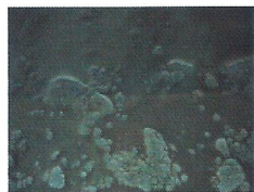
CHARCOAL (black base)