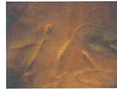
MAHOGANY (black base)