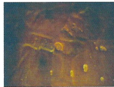
SEQUOIA (black base)