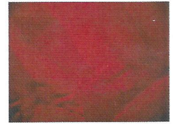
WINE RED (black base)