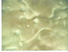
BLONDE (black base)