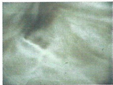
SLATE (black base)