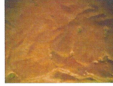
BRASS (black base)