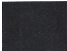
ONYX (black base)