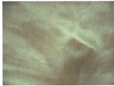
CHAMPAGNE (black base)